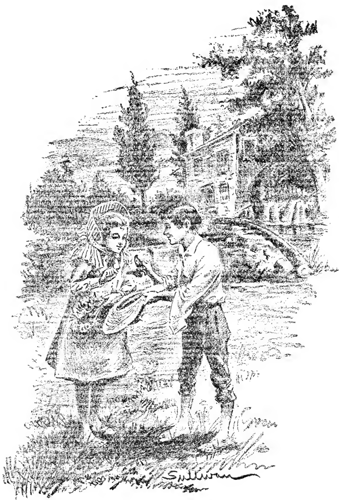
"While chasing butterfly or bee"